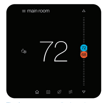
The home screen displays the current temperature, the system mode, a set-point adjustment slider, and icons leading to the other top-level screens.

First year of Daikin One cloud services included with purchase. Ask your Daikin contractor for more information!