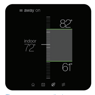
The away screen displays energy saving set-points. Away mode can be selected manually or entered automatically using geo-fencing in the Daikin One home app.