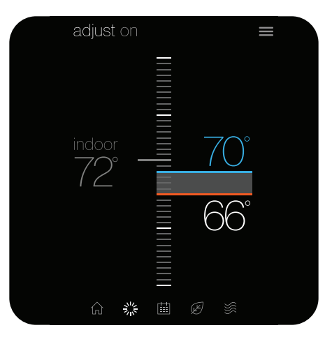
The adjust screen displays the current temperature on the left and set-points on the right. Change the set-points by dragging them or by turning the dial.