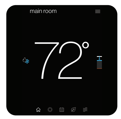
The home screen displays the current temperature, the current system mode, and icons leading to each of the top level screens.