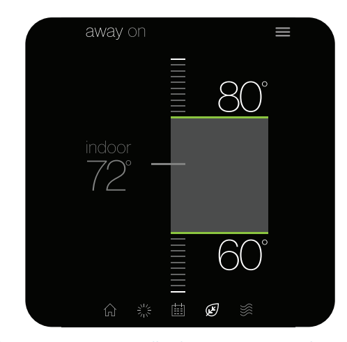
The away screen displays energy saving set-points. Energy saving can be invoked manually or automatically when the mobile app recognizes everyone is away.