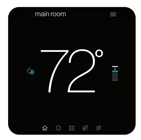
The home screen displays the current temperature, the current system mode, and icons leading to each of the top level screens.