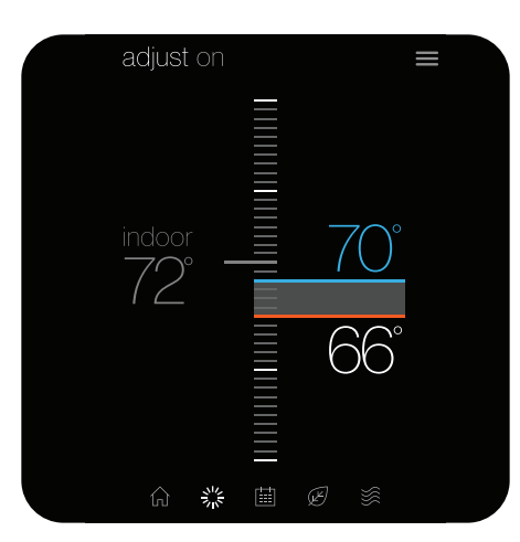
The adjust screen displays the current temperature on the left and set-points on the right. Change the set-points by dragging them or by turning the dial.