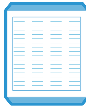
TRADITIONAL (CUBE STYLE) OUTDOOR UNIT

When installation space is limited, families shouldn't need to compromise on comfort. Ideal for zero lot lines, roof, wall, or terrace areas, the Daikin Fit features a new style solution allowing you to meet the demands of homes with the strictest of limitations with relative ease.